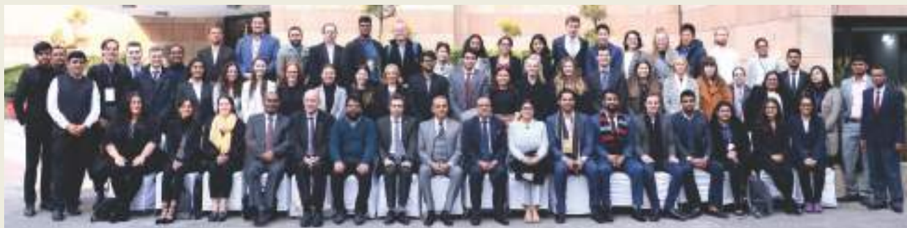
The faculty & students from Australian Universities (Deakin, La Trobe, Monash, Murdoch, RMIT, New England, New South Wales & Wollongong) and O.P. Jindal Global University, Gurgaon visited SSIFS on 10 January 2020.