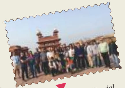
Visit of participants of 3rd Special Course for Diplomats from Syria and 4th Special Course for Iraq to Fatehpur Sikri