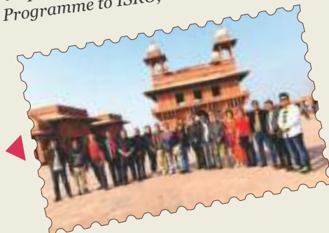
Visit of participants of 1st Special Course for Diplomats from BIMSTEC Countries to Fatehpur Sikri, Agra