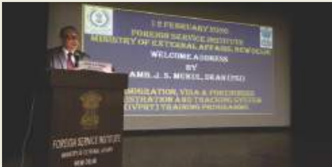
Dean (SSIFS) welcoming participants of IVFRT Training