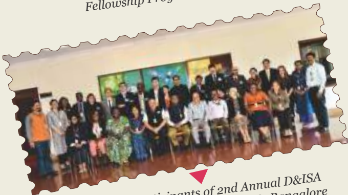
Visit of participants of 2nd Annual D&ISA Fellowship Programme to ISRO, Bangalore