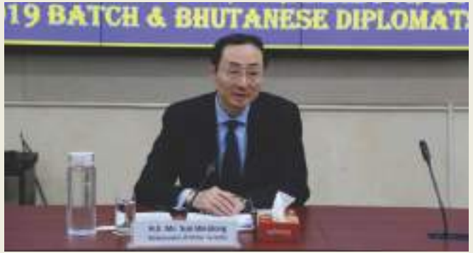
IFS OTs' interaction with H.E. Mr. Sun Weidong, Ambassador of China to India