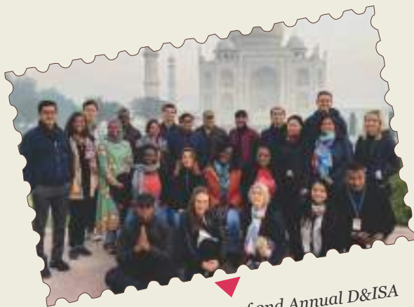
Visit of participants of 2nd Annual D&ISA Fellowship Programme to Taj Mahal, Agra