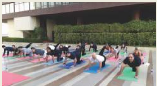
Diplomats from Syria and Iraq participated in Yoga Session