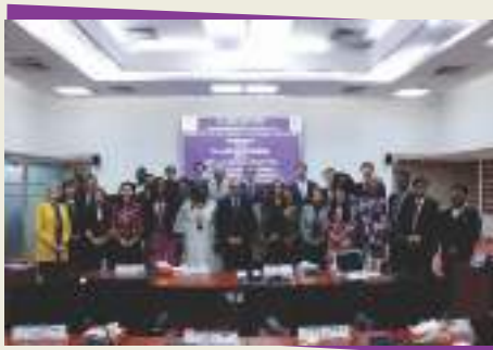
Valedictory session of 2nd Annual D&ISA Fellowship Programme