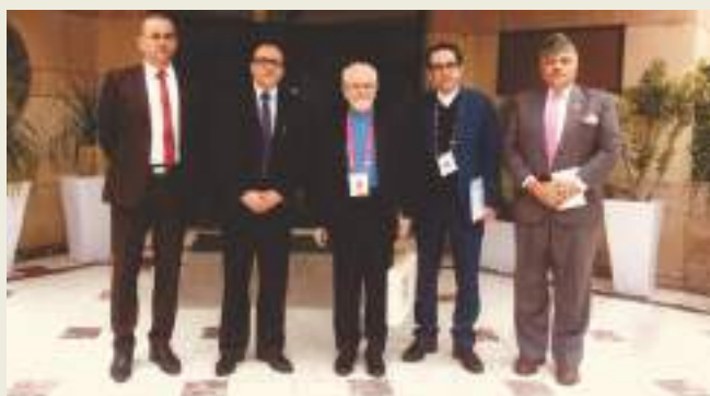
Dr. Seyed Kazem Sajjadpour, Deputy Foreign Minister of Iran visited SSIFS on 16 January 2020 to discuss training of Iranian diplomats at SSIFS.