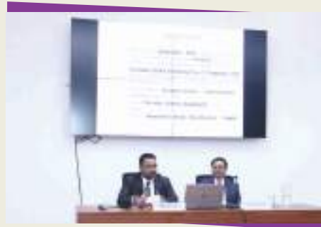
Country presentation by BIMSTEC Secretariat diplomats