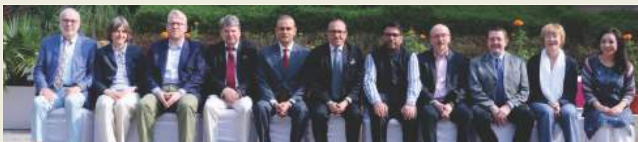
Professors from German Universities visited SSIFS on 2 March 2020 and interacted with Dean (SSIFS).