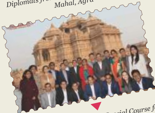
Visit of participants of 1st Special Course for Diplomats from BIMSTEC Countries to Akshardham, New Delhi