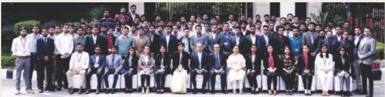
Induction Training Programme for 92 new Direct Recruit ASOs was organised at SSIFS.