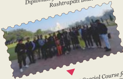
Visit of participants of 1st Special Course for Diplomats from BIMSTEC Countries to Taj Mahal, Agra