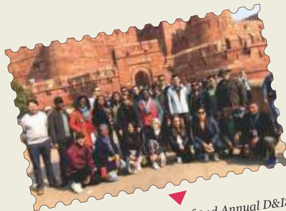
Visit of participants of 2nd Annual D&ISA Fellowship Programme to Agra Fort