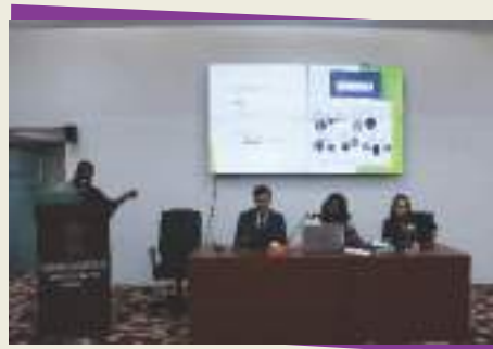
Country presentation by participants of 2nd Annual D&ISA Fellowship Programme