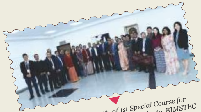
Visit of participants of 1st Special Course for Diplomats from BIMSTEC Countries to BIMSTEC Centre for Weather and Climate, Noida