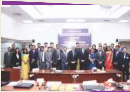
Valedictory session of 1st Special Course for Diplomats from BIMSTEC Countries