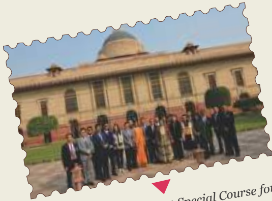
Visit of participants of 1st Special Course for Diplomats from BIMSTEC Countries to Rashtrapati Bhavan