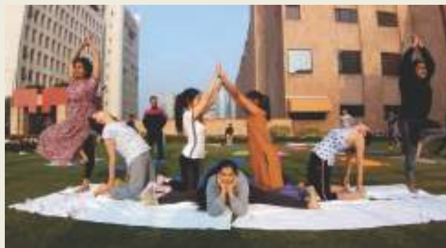
Diplomats from BIMSTEC Countries participated in Yoga Session