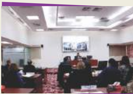
Country presentation by Syrian diplomats