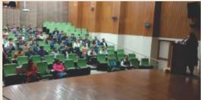
IVFRT Session in progress