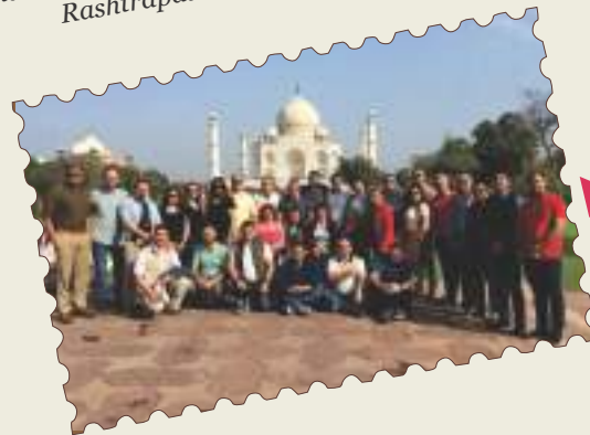
Visit of participants of 3rd Special Course for Diplomats from Syria and 4th Special Course for Iraq to Taj Mahal, Agra