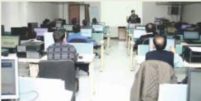
Participants of IVFRT undergoing hands-on training