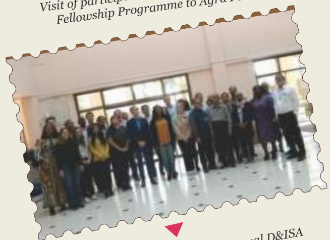
Visit of participants of 2nd Annual D&ISA Fellowship Programme to Department of Atomic Energy, Mumbai