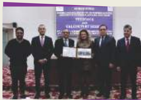
Valedictory session of 3rd Special Course for Diplomats from Syria and 4th Special Course for Diplomats from Iraq.