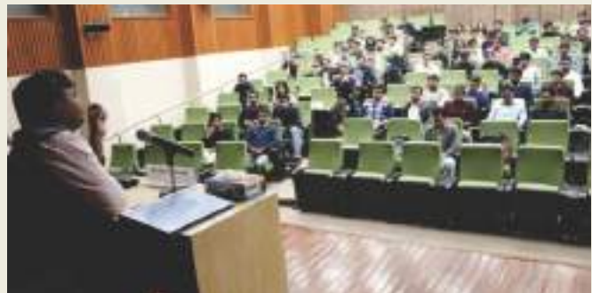
Induction Training Programme for Direct Recruit ASOs in progress