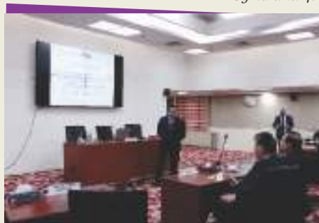
Country presentation by Iraqi diplomats